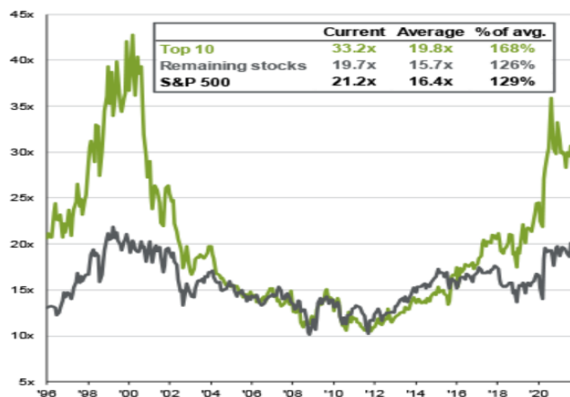
P/E ratio of the top 10 and remaining stocks in the S&P 500 Next 12 months